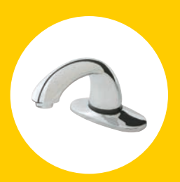
AUTOFAUCET® CENTER SET MILANO 1818967